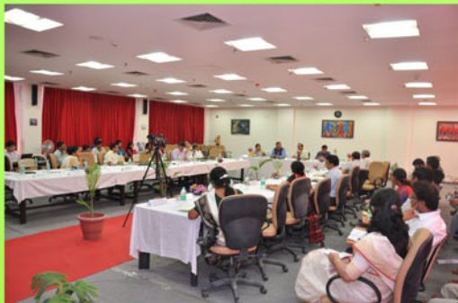
Research Conclave held on 25 June, 2014

Cool with temperatures ranging from 12 - 16 °C at night and 15 - 22 °C during the day. Woolen clothes are required during the period.