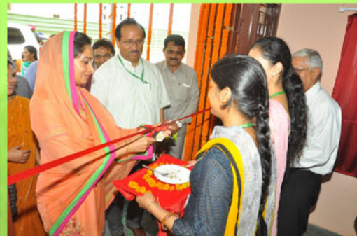
Visit of Ms. Harsimrat Kaur Badal, Hon'ble Union Minister, Ministry of Food Processing Industries, Govt. of India