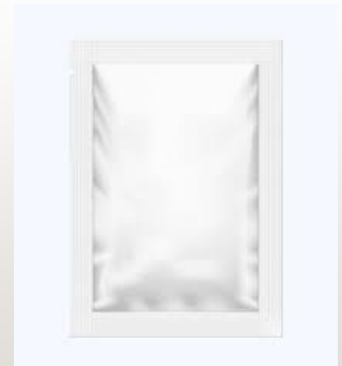
Four sides seal formation