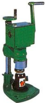
LUG Cap Sealer (Mechanical)