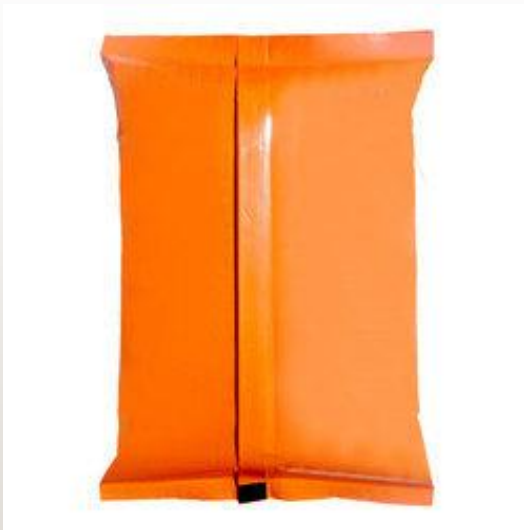
Centre seal formation