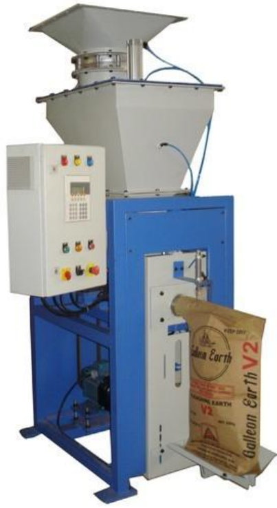
Bag filling machine