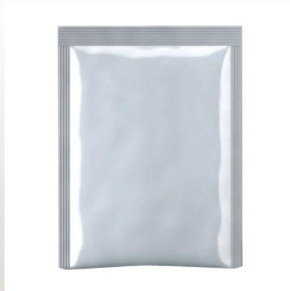
Three sides seal formation