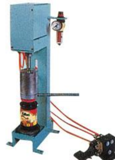
LUG Cap Sealer (Pneumatic)