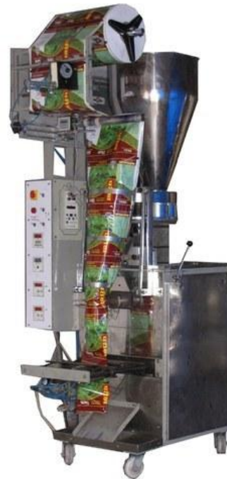
Automatic FFS machine