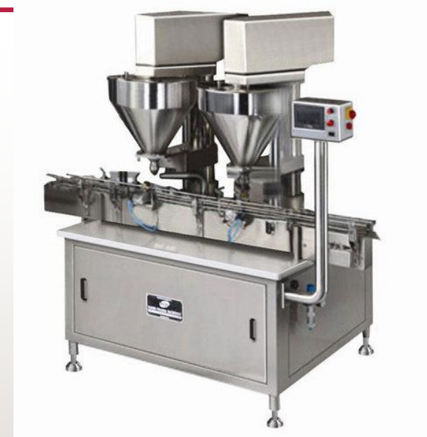
Automatic double head power filling machine