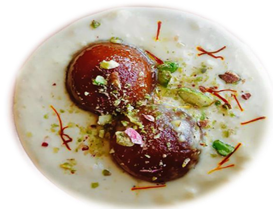
Gulab Jamun with rabri