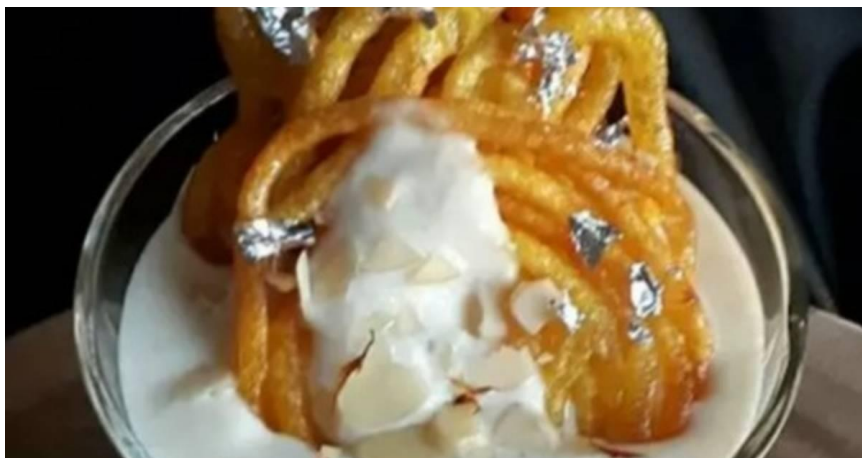
Jalebi with rabri